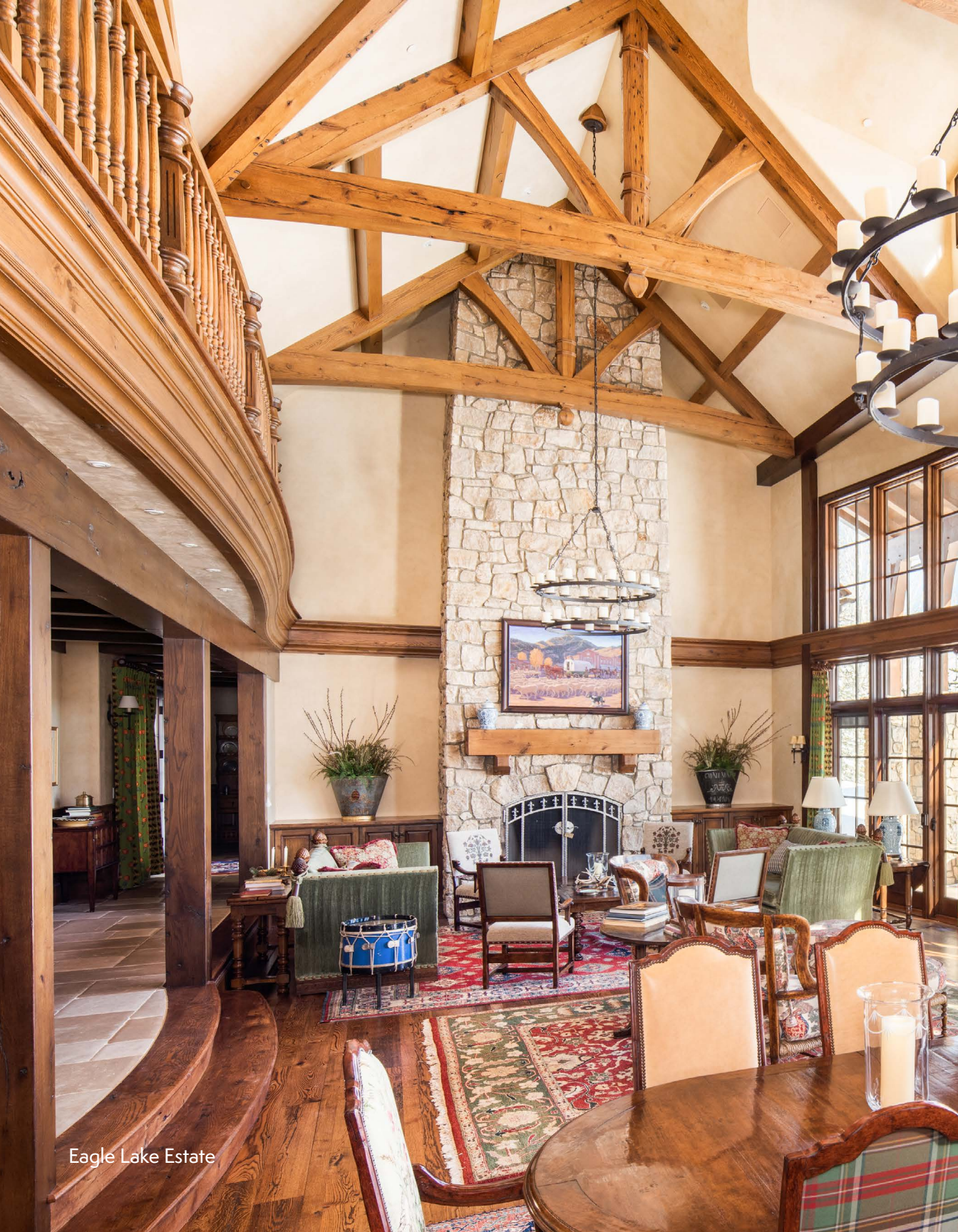
Eagle Lake Estate