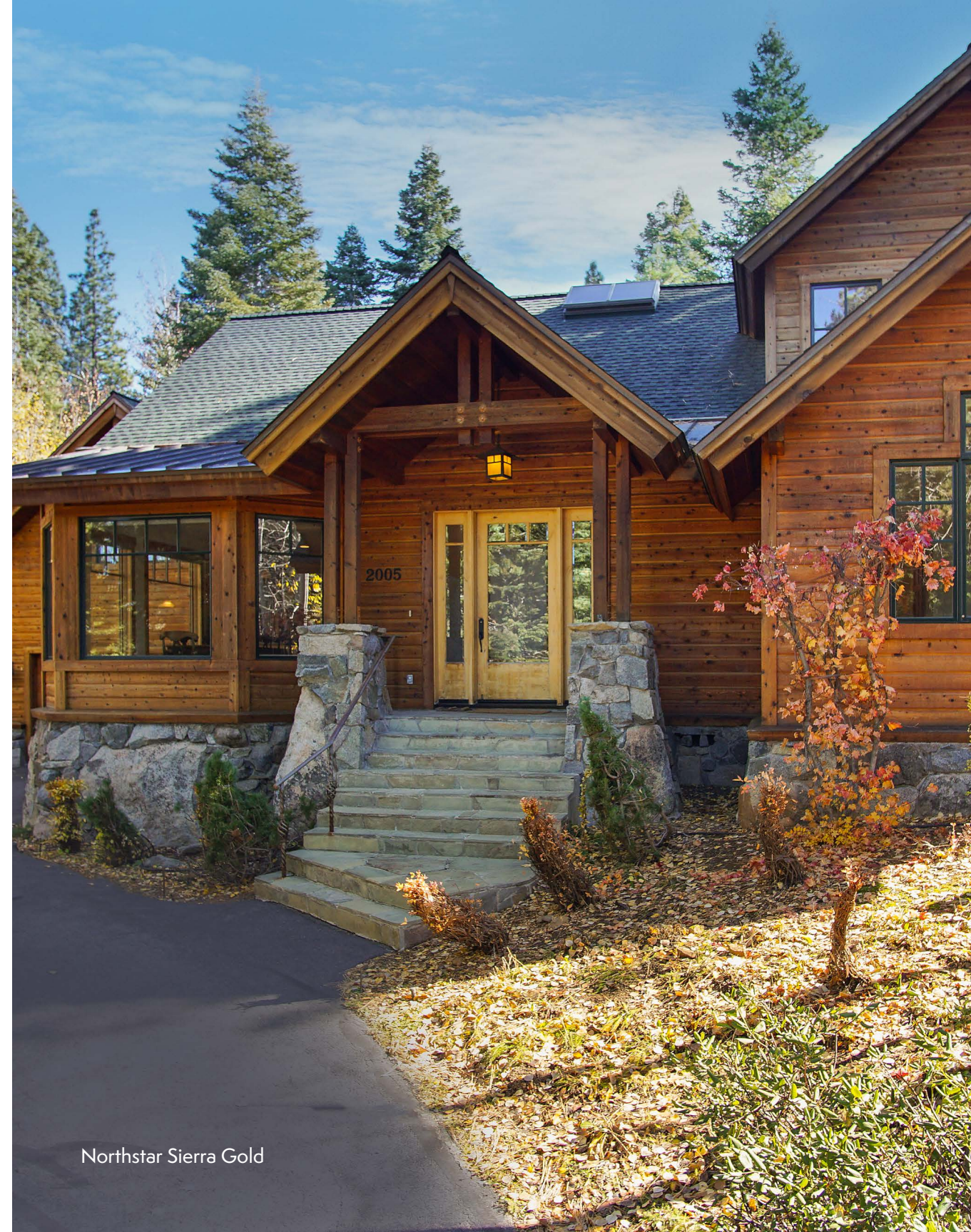
Northstar Sierra Gold

Our collection of Lake Tahoe vacation rentals hug the mountains along the North Shore, offering easy access to both skiing and beach activities. Choose from newly constructed condos with contemporary decor and ski-in/ski-out access to Northstar resort, log cabins with cozy wood-burning stoves and lake views, or timber homes with expansive decks and open living spaces.