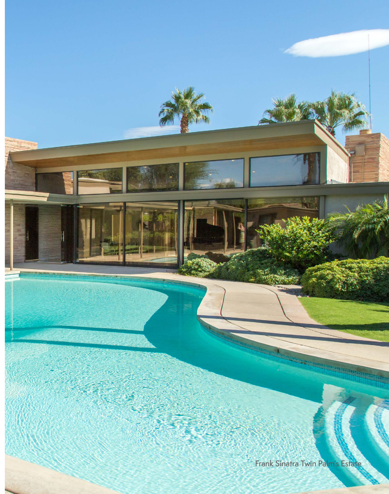
Frank Sinatra Twin Palm's Estate

Our Palm Springs vacation homes tell a unique story through creative artwork and furnishings, handpicked for distinctive architecture and design. Our collection includes Frank Sinatra's Twin Palms Estate, with its famous piano-shaped swimming pool, and an original Hugh Kaptur-designed home built into the mountain with glass-paneled walls. Many of our luxury homes sit on gated, landscaped grounds within walking distance of downtown Palm Springs.