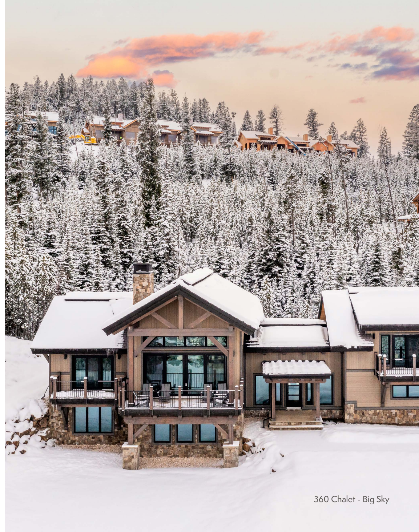
360 Chalet - Big Sky

Natural Retreats 360 Blue Alaya Collection by 360 Blue Callista by 360 Blue