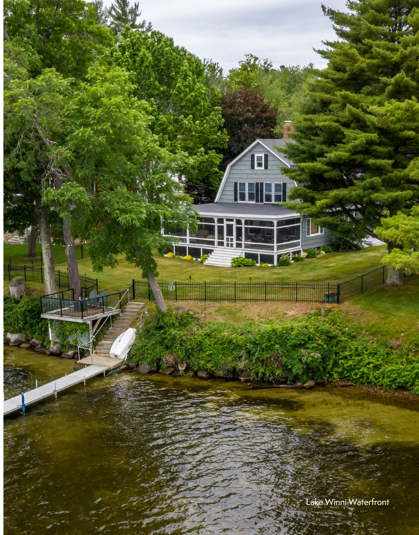
Lake Winni Waterfront

Home to America's oldest summer resort town, iconic Wolfeboro on Lake Winnepesaukee, the Lakes Region of New Hampshire has attracted families to its postcard-worthy shores and quaint New England towns for centuries. Our collection of New Hampshire lakes vacation rentals provides an escape from modern life with homes on Weirs Beach, Meredith, Shell Camp Lake, and Lake Winnepesaukee. Each of our Lake Winnepesaukee cabin rentals lies on forested grounds with easy access to the lake for swimming, boating, and fishing in the Summer and spectacular leaf-peeping in the Fall. Many offer private beaches and docks.