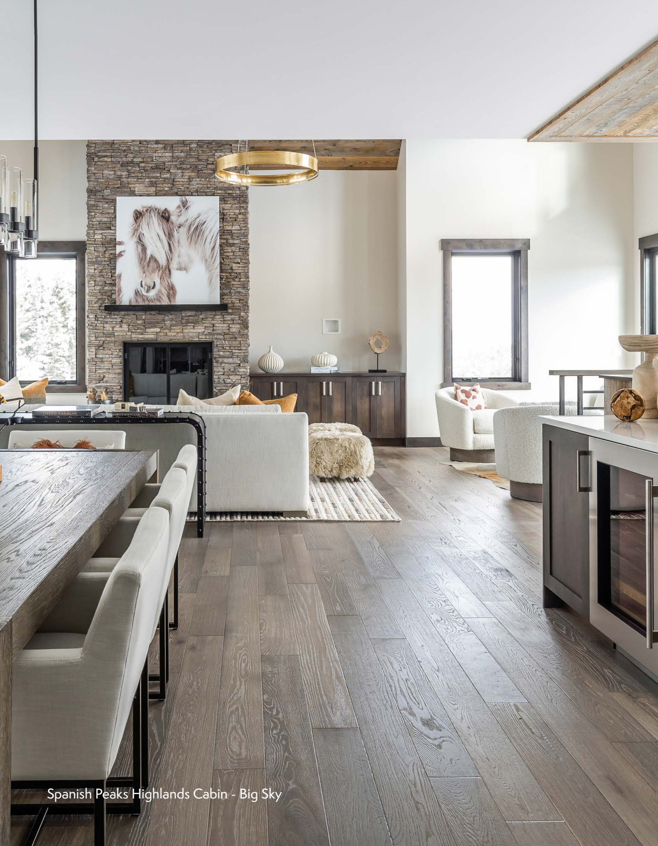
Spanish Peaks Highlands Cabin - Big Sky

NATURAL RETREATS Our Collection of Brands