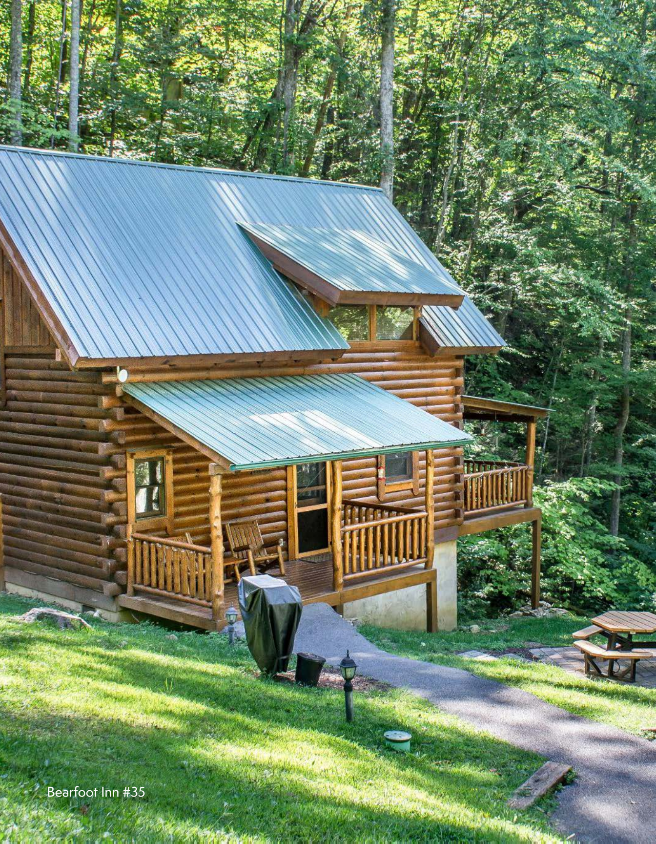
Bearfoot Inn #35